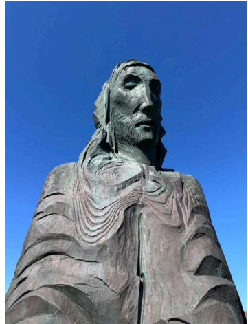
The St. John's Pilgrimage group 2026.